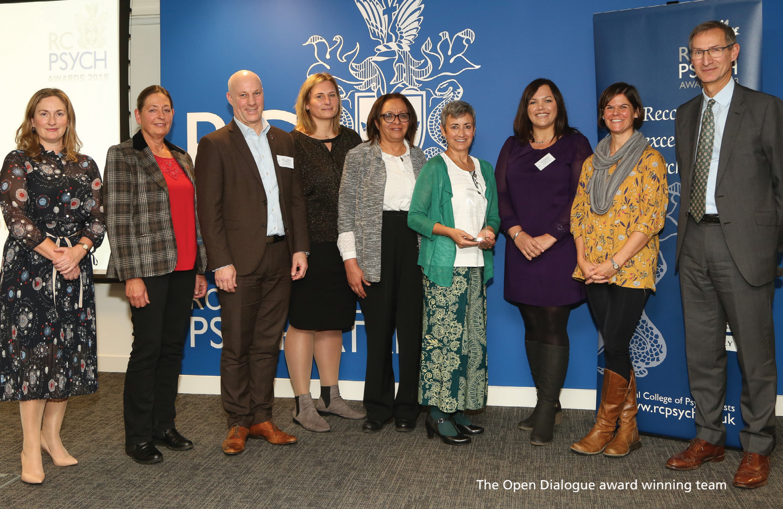
The Open Dialogue award winning team

Everyone in the room then listens to one another and has an input in the decision-making before agreement is reached collectively on ways forward. And it will be that same group throughout the process with as many meetings as are needed. Relationships are central to the approach and trust develops in the process.