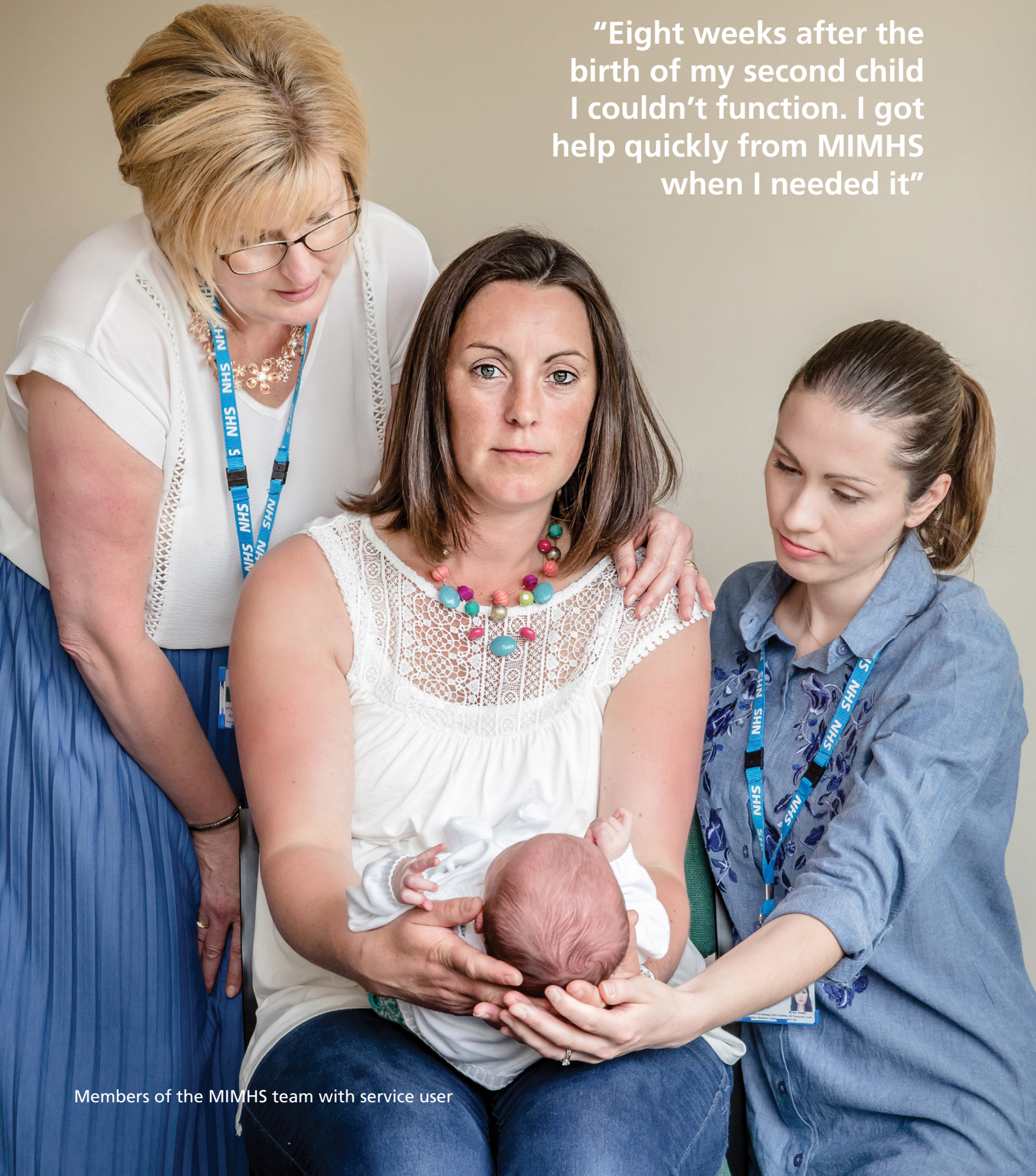
Members of the MIMHS team with service user

“Eight weeks after the birth of my second child I couldn't function. I got help quickly from MIMHS when I needed it”